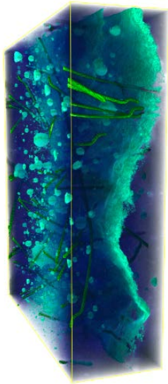
Picture 2 Visualization of the same crack in a CT image.