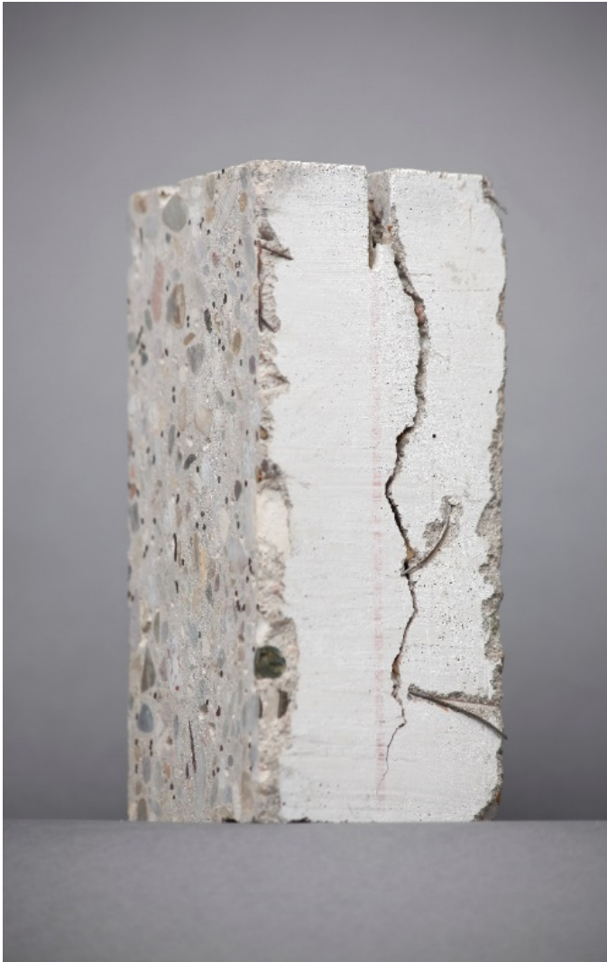
Picture 1 Concrete sample with crack.